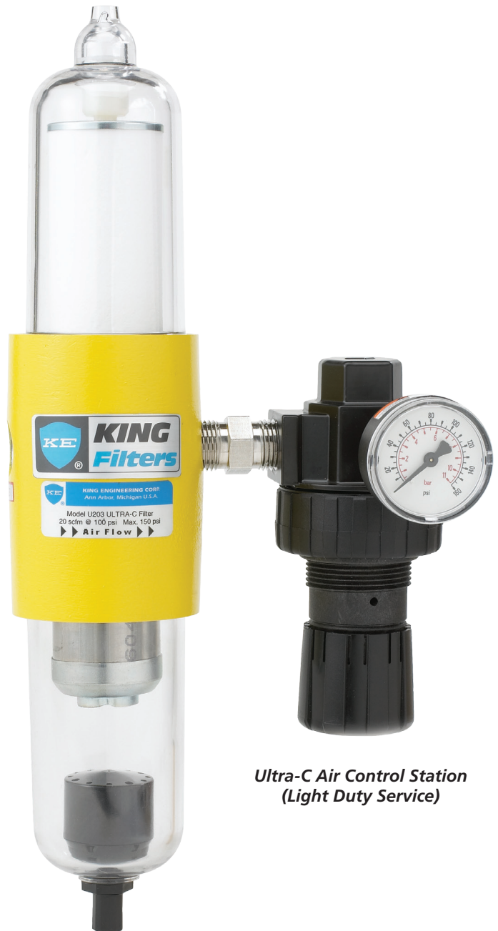
Ultra-C Air Control Station (Light Duty Service)

KING U205 Air Control Stations are intended for light duty environments not directly exposed to salt water and/or prolonged direct sunlight exposure. The U205 has an aluminum housing with polycarbonate sumps, while the regulator is supplied with cast zinc body. Inlet and outlet connections are 1/2" NPT designed to accept standard tube or pipe fittings.